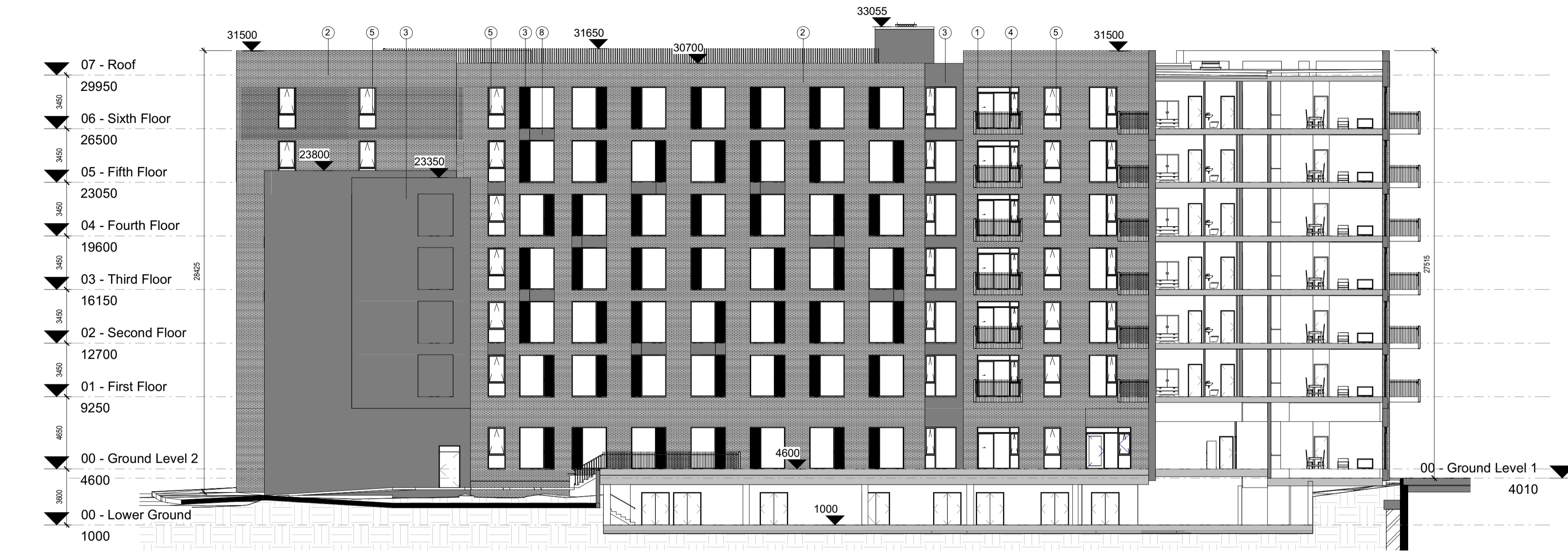
1 Block 2 - Section G-G 1 : 200

NOTE ALL DIMENSIONS TO BE CHECKED ON SITE NO DIMENSIONS TO BE SCALED FROM THIS DRAWING THIS DRAWING IS TO BE READ IN CONJUNCTION WITH RELEVANT CONSULTANTS DRAWINGS